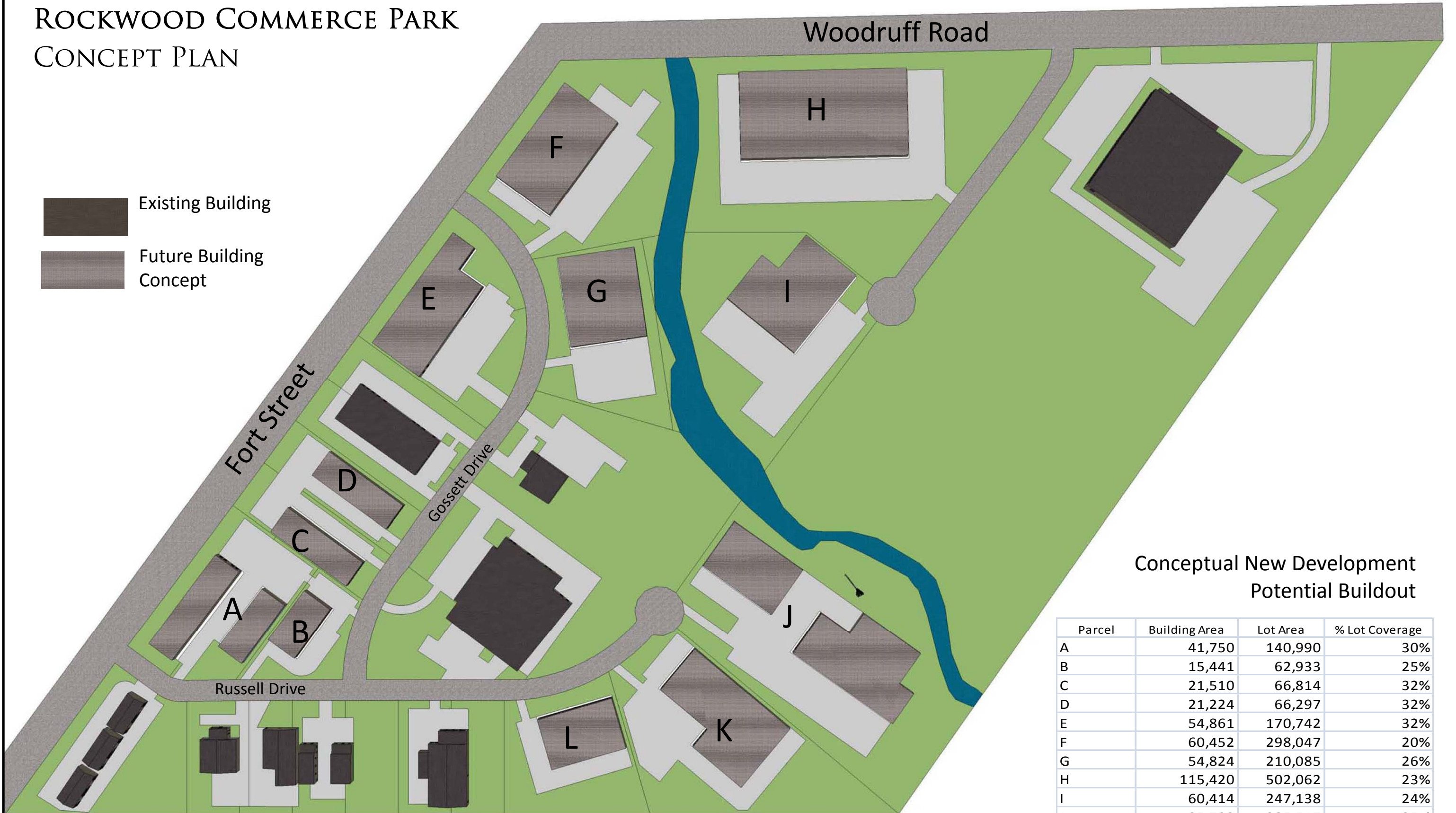
Conceptual New Development Potential Buildout